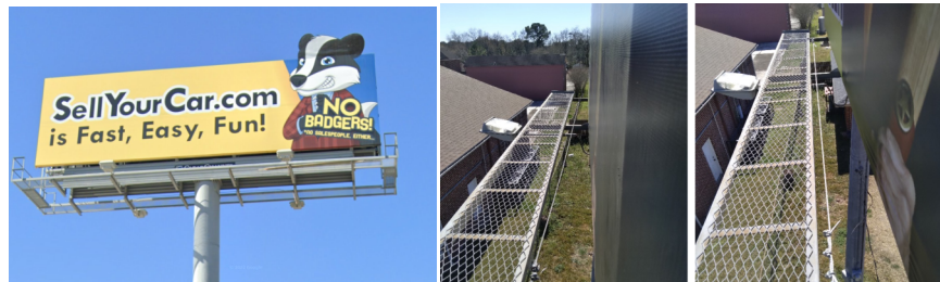
Photos from a completed Job ticket in Pasadena, Texas to remove and replace a damaged safety cable. Start ticket included address, priority, GPS map directions, notes and before photo. Completed ticket included notes, after photos and time on site.